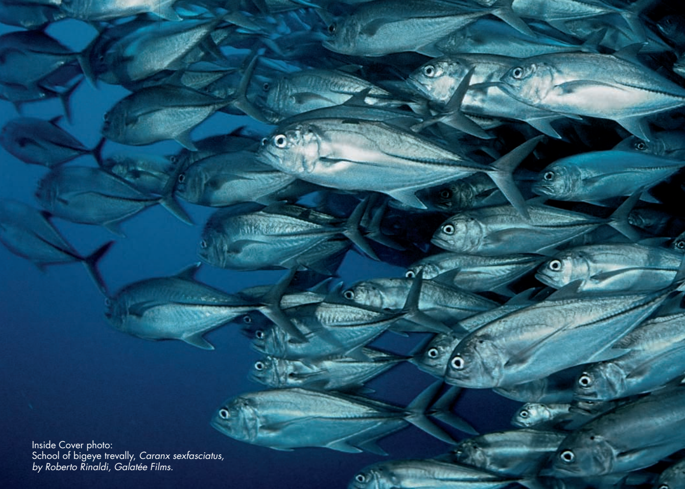
Inside Cover photo: School of bigeye trevally, Caranx sexfasciatus , by Roberto Rinaldi, Galatée Films.